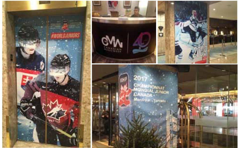
Examples of venue branding: (clockwise left to right) elevator door wraps, CMW registration counter, hotel main lobby pillar, hotel main entrance pillar.

Co-branding of the Radiodays North America venue (e.g. Venue lounge area, venue entrance, Slanted windows outside main RDNA Harbour Ballroom, registration area (including counter), elevators, escalators, Corporate colours on LED lobby pillars. floors, steps, Dedicated TV channel in guestroom for delegates, Banner in the Motorcourt, etc.). For images, quotes and individual suggestions, please contact kristen@cmw.net